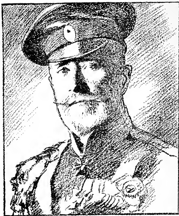
The Grand Duke Nicholas